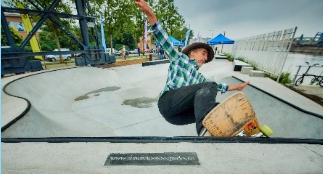
@Port de Bruxelles